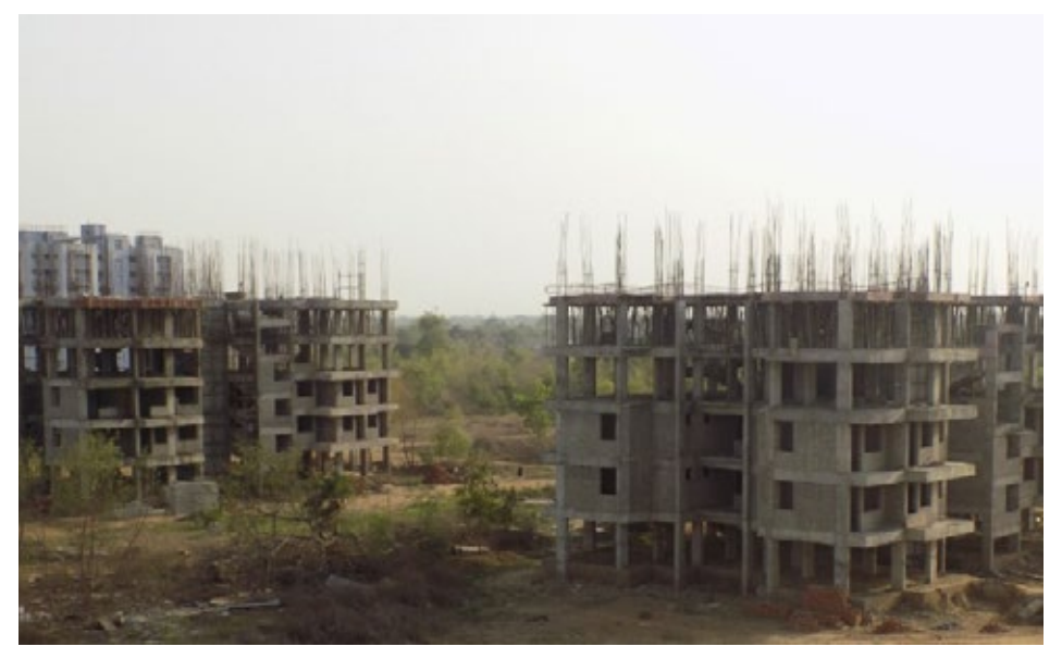
C type Quarters (Capacity: 56 units) 40% complete(RCC of 5th floor is in progress