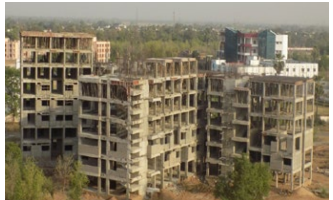
Boys Hostel (Capacity: 450 capacity)45% complete (RCC of 6<sup>th</sup> and 7thfloor is in progress)