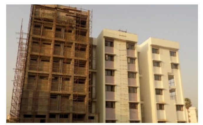
Girls Hostel (Capacity: 200) 90% complete (Painting, fittings and fixing in progress)

Project Management Consultant for this part is Engineers India Limited (EIL). The contractor is M/s Kamladitya Construction Private Limited. The Status of ongoing works under EIL is as follows: